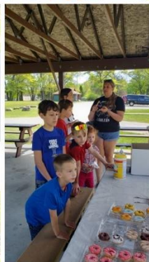
Sunday School 2024 End of the Year Picnic